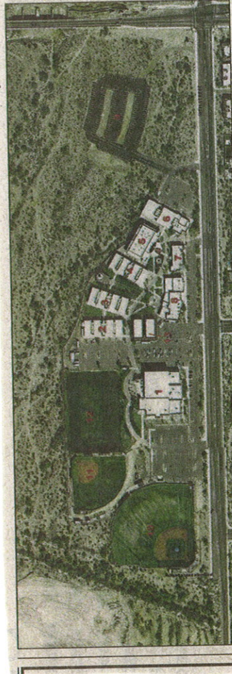
NOTRE DAME PREPARATORY

Notre Dame Preparatory is developing plans for a $76 million expansion project.